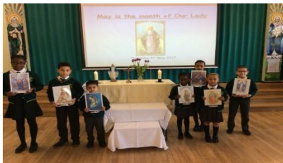
Our Assembly celebrating month of Mary

The month of May is the month dedicated to Our Blessed Lady. During this month both in school and the church, we offer up to Mary homage of prayer and veneration. In school we will be reading about and reflecting on the life of Mary while following her examples of obedience, love and compassion.